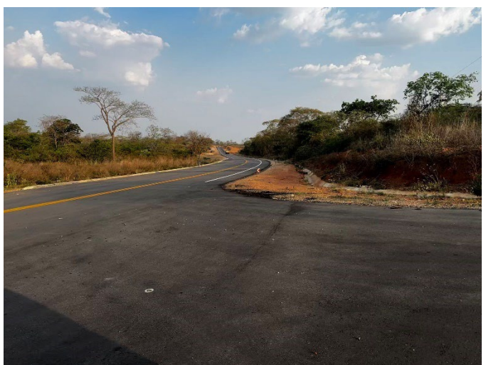
Picture 9: Panel picture of the T-junction where the upgraded road joins the village access road to the community of San Pablo, San Rafael.

one of its members was taking their three cows to the atajado on the other side of the road when a truck hit and killed a cow. According to the community member, the truck driver then swerved to avoid a motorcycle coming from the opposite direction and overturned on the roadside, injuring two school-age pedestrians. When the person reported the accident and the cow's death, and raised concerns about road safety, this person was allegedly blamed for the accident and threatened with arrest by the Police.