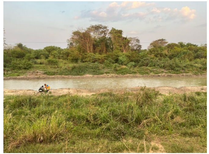
Picture 5: A roadside atajado in San Antonio, San José de Chiquitos, which the community claims is contaminated from the silt from the raised roadbed's embankment.

Table 2: Alleged impact of Project in the Chiquitano communities as identified in field interviews.