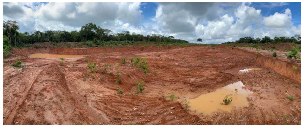
Picture 3: A site where the Cuarrió, San Miguel community claim the Contractor had removed topsoil to use in the road construction.