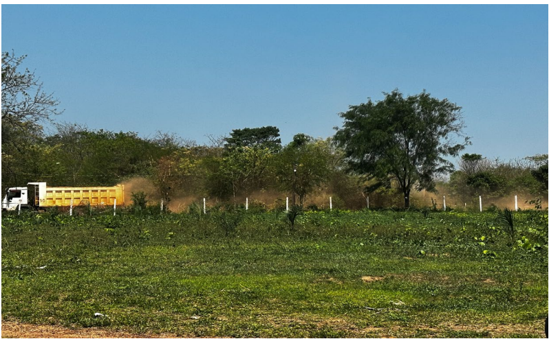
Picture 8: View of dust cloud from Nuevo Horizonte (San José de Chiquitos)'s community center as the dump truck passes by the community's unpaved access road.

240. During its September 2023 visit, the Panel heard from community members in Nuevo Horizonte that the Contractor's and subcontractor's dump trucks drive constantly on the unpaved access road through their village to extract materials from the neighboring community Caballito de Oro's borrow pit. During the two hours spent with the community, the Panel observed approximately one dump truck every five minutes on this road. The Panel noted that a section of the road ran in front of many houses in the village. The Panel observed clouds of heavy dust each time a truck carrying excavated materials from Caballito de Oro to the road construction site passed by these houses (see picture below). The Panel was told that the communities frequently asked the Project to spray the unpaved road with water to reduce the dust and risks to community members' health and safety. The community said trucks use the road from around 7:00 a.m. to 9:00 p.m. almost daily.