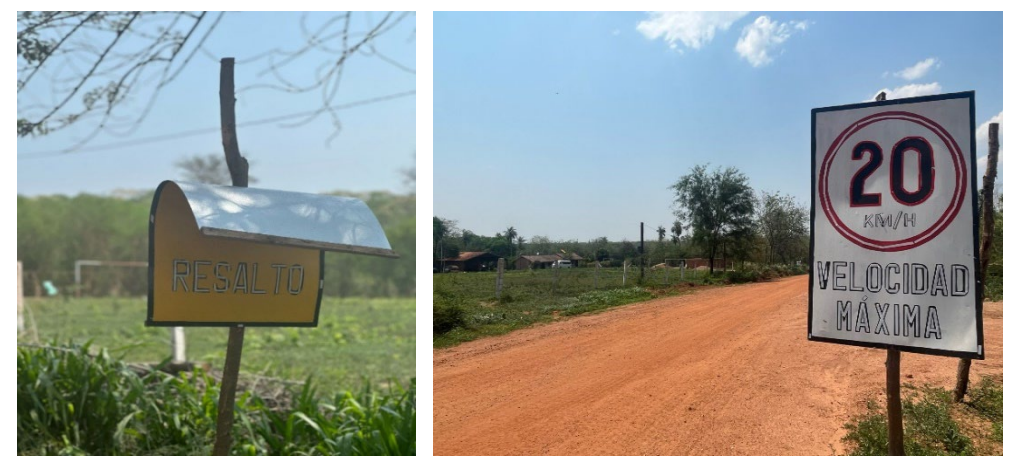
Pictures 6 and 7: Left - Speed bump sign secured to twig. Right - Reflective speed sign secured to twig.

240. During its September 2023 visit, the Panel heard from community members in Nuevo Horizonte that the Contractor's and subcontractor's dump trucks drive constantly on the unpaved access road through their village to extract materials from the neighboring community Caballito de Oro's borrow pit. During the two hours spent with the community, the Panel observed approximately one dump truck every five minutes on this road. The Panel noted that a section of the road ran in front of many houses in the village. The Panel observed clouds of heavy dust each time a truck carrying excavated materials from Caballito de Oro to the road construction site passed by these houses (see picture below). The Panel was told that the communities frequently asked the Project to spray the unpaved road with water to reduce the dust and risks to community members' health and safety. The community said trucks use the road from around 7:00 a.m. to 9:00 p.m. almost daily.