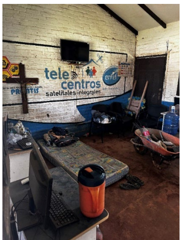
Picture 12: Right - Subcontractor workers' accommodation in Nuevo Horizonte (San José de Chiquitos) school classroom shown to the Panel by the community.

293. In September 2023, the Panel observed that most of the worker contract issues raised in the Request had been addressed in the communities it visited. Workers employed directly by the Contractor told the Panel that ongoing contracts had replaced their previous, back-to-back short-term contracts. They considered this a major improvement in their working conditions, especially since most of them said they were now paid regularly – every 15 days. Most of the Contractor workers with whom the Panel spoke claimed they now have access to benefits, such as health care, hygiene kits, and replacement PPE. A few community members explained to the Panel that their medical coverage is only valid in Santa Cruz. All of them said they had signed the CoC and have received SEA/SH training.