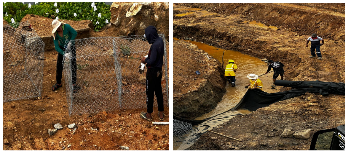
Pictures 10 and 11: Workers without appropriate PPE, observed by the Panel, adjacent to the road corridor.

291. The Panel spoke to workers in Sapocó who said they had little knowledge about how to operate their machines and that more safety training about operating them would mean fewer accidents. In Medio Monte, workers said they had no proper place to eat, away from the dust and heat. In some of the communities the Panel visited, workers complained about the inadequate supply and late replacement of PPE. In September 2023, while driving along the entire the road, the Panel observed that most workers appeared to be wearing adequate PPE, although it did see some workers who were not wearing the appropriate PPE (see pictures below).