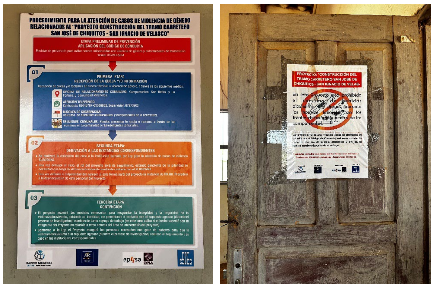
Pictures 13 and 14: Left - A poster in one of the communities that explains the process of raising GBV concerns. Right - A sign in one of the communities that provides guidance to workers on their behaviors as per the CoC.

358. As explained in Chapter 3, the Project has multiple channels through which communities can raise grievances.<sup>470</sup> During the Panel's September 2023 field visit, it observed that some communities had signs on how to raise concerns related to GBV, as well as guidance to workers on their behaviors as per the CoC (see pictures below). Nevertheless, the communities feel they cannot access most of these channels, particularly the GRM, believing they neither serve a useful purpose nor appreciate the realities of the Chiquitano way of life. The Panel understands that the Chiquitano are an indigenous group who mostly rely on their customary dispute settlement process, overseen by the Caciques , to resolve community concerns. During the Panel's September 2023 visit, the SLIMs and community members told the Panel that survivors usually prefer to ask their Caciques for help with internal community disputes or personal complaints. The Panel notes the Project's efforts to train and sensitize the Caciques on the seriousness of SEA/SH, and to include them in the GRM process.