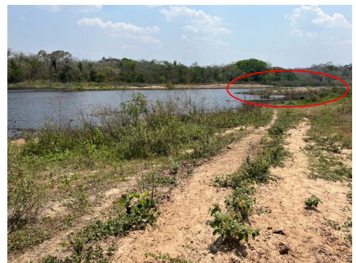
Picture 4: An atajado in San Fermín, San Rafael, where the community claims the Contractor left two large sediment dumps (one of which is circled).

In the village of Medio Monte, the community said the Contractor signed an agreement with them in May 2022 to excavate a borrow pit, in exchange for which the Contractor would clear 10 hectares of land, install an access road, and build a sports field. These commitments were met. The Panel understands three borrow pits are being excavated in Medio Monte. The community said they had asked for these borrow pits to be converted into atajados once excavation was completed, but that the Contractor has not fulfilled this part of the agreement. The community said after it protested and two weeks prior to the Panel's investigation mission, a meeting with ABC, the Supervision Firm, and the Contractor was held. There ABC said it could improve the banks of the existing atajados , but without indicating how long this would take to complete. The community showed the Panel the minutes of the meeting in the form of an acta (a formal, signed record).